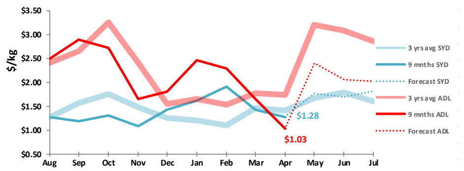
Monthly prices: last 3-year average, current 9-months & 3-month forecast