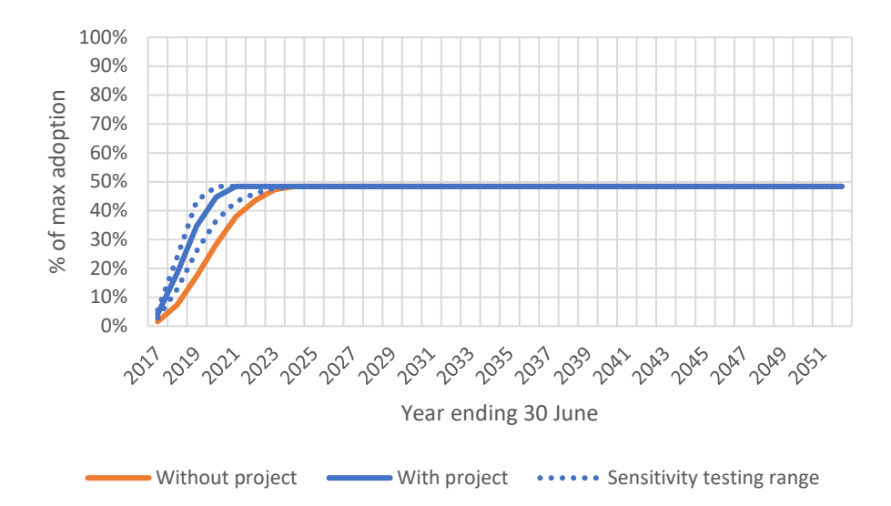
Figure 2. Change in adoption and diffusion curve from MC15004 generating increased awareness, knowledge and resources relating to macadamia innovation and best-practice. Includes sensitivity testing of ±50% of the baseline yearly change.

1. What proportion of farmers have maximising profit as a strong motivation? A majority have maximising profit as a strong motivation