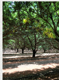
Lower limb dieback syndrome

Dieback of lower limbs is very common. It has multiple causes - shading, canker diseases, water stress and severe hull rot infection, as well as lower limb dieback syndrome (LLD). The role of fungal pathogens in LLD is still under investigation.