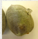
Not anthracnose or bacterial spot