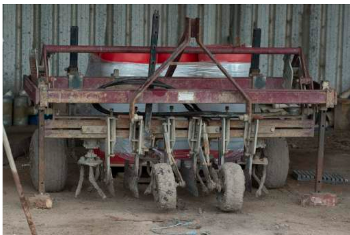
Figure 3 A 'Weedfix' inter-row cultivator, used on the farm in less mature leek crops for shallow cultivation within the crop bed.

Amongst the crops grown on the farm, celery and leeks are particularly suited to inter-row cultivation because of their relatively upright form. However, inter-row cultivation is used to varying degrees within all crops grown by the business.