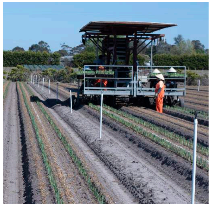
Figure 1 Planting a leek crop.

Today, Schreurs & Sons' most significant crop is celery, with approximately 20,000 tonnes grown each year. Other important crops include leek (Figure 1), spinach, rocket, and snow pea tendrils. Crops are grown intensively year-round, with a winter fallow period.