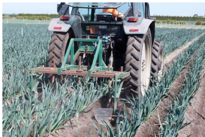
Figure 4 A customised inter-row cultivator, set up to the specific bed and row spacing used on the farm. The cultivator is being used within a more mature leek crop to cultivate within the crop bed as well as the wheel tracks.