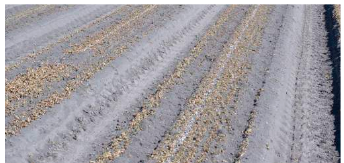
Figure 2 A stale seed bed, ready for crop planting.

The length of time a stale seed bed approach can be used by Schreurs & Sons is usually restricted by the amount of land available to about six weeks. Ideally, Adam would like to use longer-running stale seed beds, using a mixture of glyphosate application and shallow cultivation to germinate and control multiple weed cohorts. This may be feasible in other vegetable crops, and may be helpful where weed seed bank levels are very high (e.g. newly used fields).