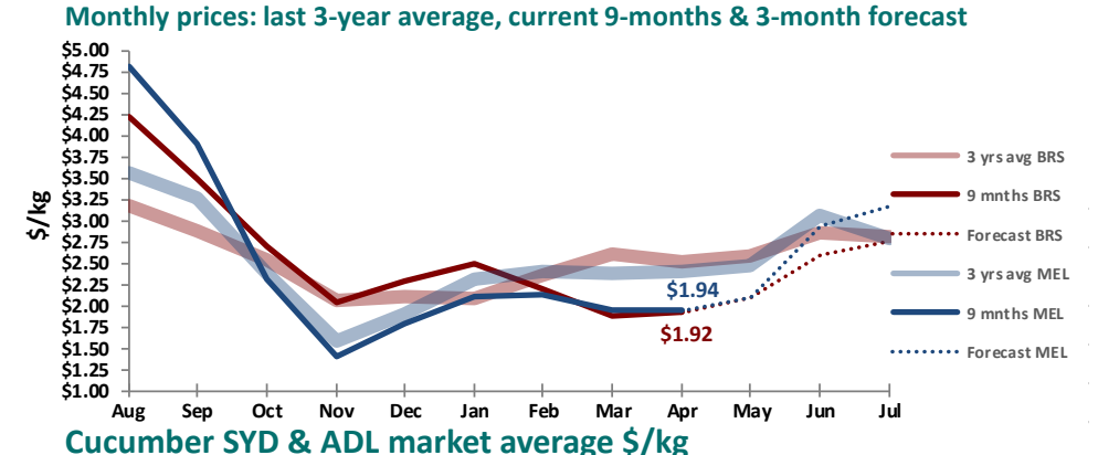
Monthly prices: last 3-year average, current 9-months & 3-month forecast