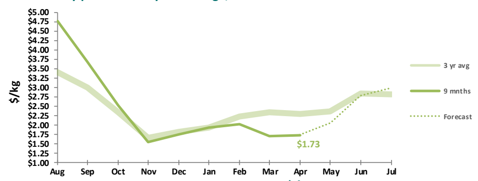
Cucumber BRS & MEL market average $/kg

Monthly prices: last 3-year average, current 9-months & 3-month forecast