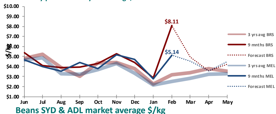
Monthly prices: last 3-year average, current 9-months & 3-month forecast