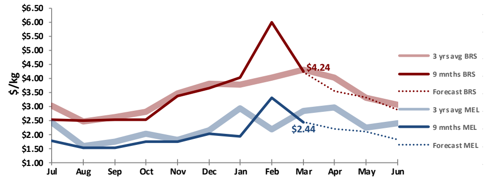
Broccoli SYD & ADL market average $/kg

Monthly prices: last 3-year average, current 9-months & 3-month forecast