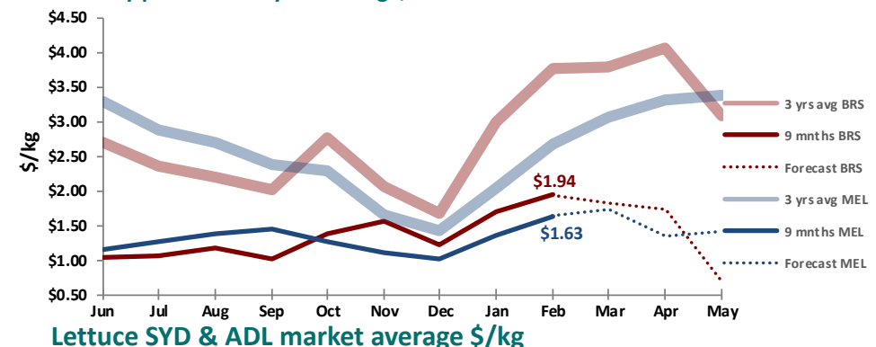
Monthly prices: last 3-year average, current 9-months & 3-month forecast