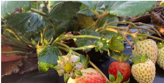
Organically certified strawberries

These exemptions are granted when it can be shown that organic plant propagation material is not available in sufficient quality or quantity.