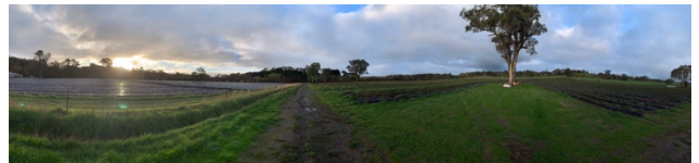
The farm at Lobethal in the Adelaide Hills

Their business philosophy revolves around improving quality, turnover and production efficiency, which is reflected in an affordable end price for their customers. They want customers to be able to choose organic produce because of preference, and not be deterred by the price.