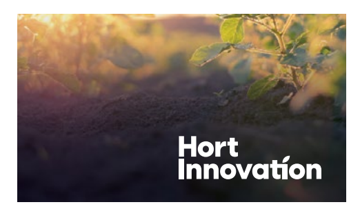
Dark area on image is preferable