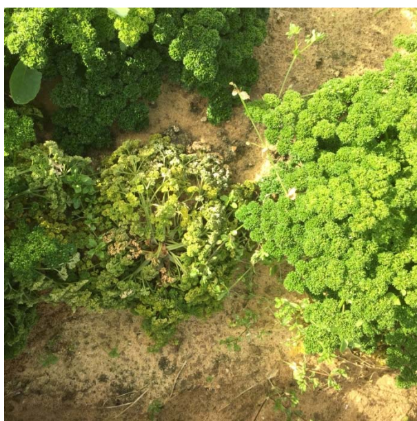
Figure 1: SRR affected parsley plant

Parsley Summer Root Rot (SRR) is a disease complex involving combinations of several different pathogenic fungi, oomycetes and bacteria. The primary pathogen is the oomycete Pythium sulcatum which can attack a range of plants botanically related to parsley such as parsnips, celery and carrots. It is also the primary cause of the important disease Cavity Rot of carrots. Another oomycete Pythium mastophorum causes a similar root rot disease while common strains of the fungi Fusarium oxysporum and Fusarium solani are commonly associated with SRR although not able to initiate the disease alone. The fungus Rhizoctonia solani can also be associated with SRR and can also cause damping off and collar rot diseases of parsley. A number of soft rot bacteria are also commonly associated with plants affected by SRR, particularly in the advanced stages of the disease.