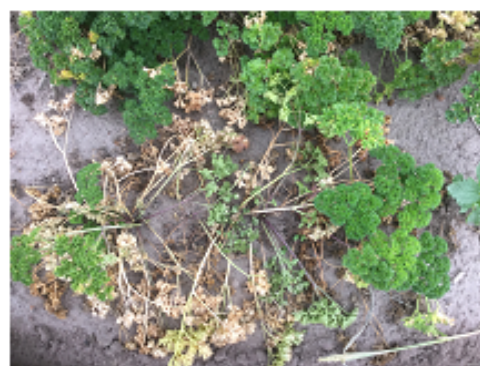
SRR affected plants wilting with purpling of petioles

understandable given the number of pathogens associated with SRR.