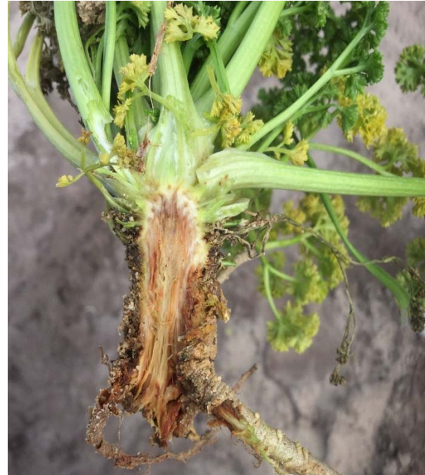
Figure 2: Advanced SRR symptoms with watery brown rot of tap root

© State of New South Wales through the Department of Trade and Investment, Regional Infrastructure and Services, 2019. You may copy, distribute and otherwise freely deal with this publication for any purpose, provided that you attribute the NSW Department of Primary Industries as the owner.