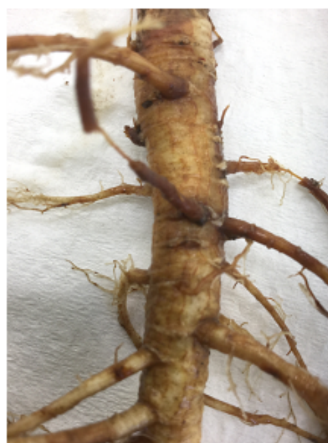
Roots with watery brown rot and stripy marks on tap root