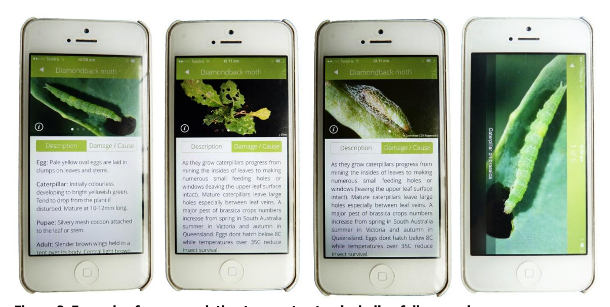
Figure 2 Example of screens relating to a pest entry, including full screen image

On opening the entry, the viewer is presented with one or more photos. Tapping an information icon ( i ) shows a caption for the photograph. Tapping the name of the disease / insect reveals its Latin name. A series of dots on the picture indicates the number of photographs available (up to nine for each entry). These have been chosen to show different lifestages of the insect, different severities of disease, closeups and wider crop shots, all of which may aid proper diagnosis. Tapping the photo allows it (and the other photos for the entry) to be rotated and viewed full screen with caption in place. Simply swiping across the screen easily and quickly scrolls through the photo collection.