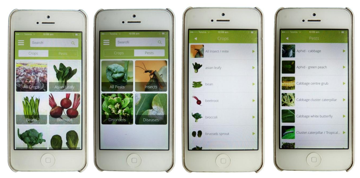
Figure 1 Opening search screens of app. In this case the user has searched by pest, then insect, then broccoli

Each entry is initially seen as a thumbnail picture, which has been selected to show the most likely symptom / insect lifestage that would be seen on the crop (Figure 1).