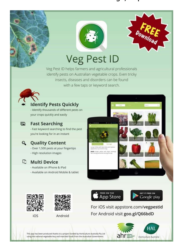
Figure 4 Poster promoting Veg Pest ID app with QR code for instant download

entire database onto the memory of the device. Depending on internet connection speed, this may mean photos are slow to appear the first time the app is used. However, it also means it can be used while offline or out of range, important for field usability.