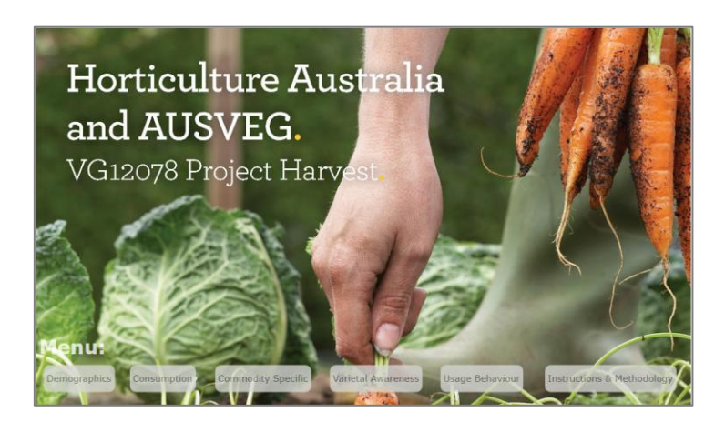
Figure 3. IRT Homepage