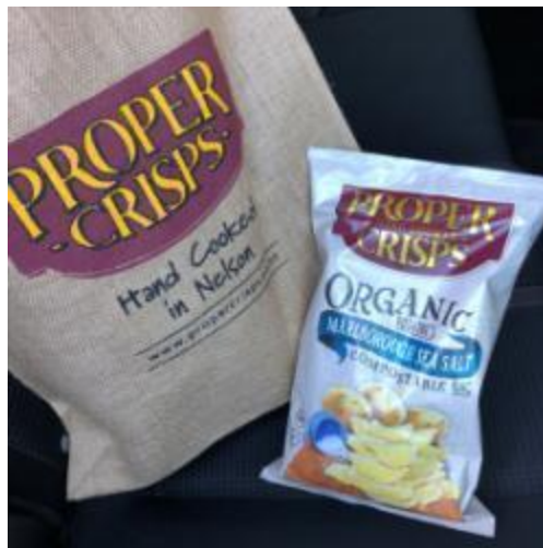
Figure 3: Proper Crisps Organic Potato Crisps packaged in a home compostable crisp bag, Proper Crisp visit, July 2019, Nelson, NZ

Proper Crisps have a strong marketing focus, and the company recently launched Crisps in 'Home Compostable Packaging' reflect their commitment to creating a sustainable future (Figure 3). They are always looking for ways to reduce their impact on the environment. They maintain their crisps are 100% Natural, Real Food, Gluten & GMO Free and are vegan-friendly, with no added MSG or trans fat. They and also provide Organic potato crisp products no Added MSG or Trans Fats, and High Oleic Sunflower Oil and Palm Oil Free.