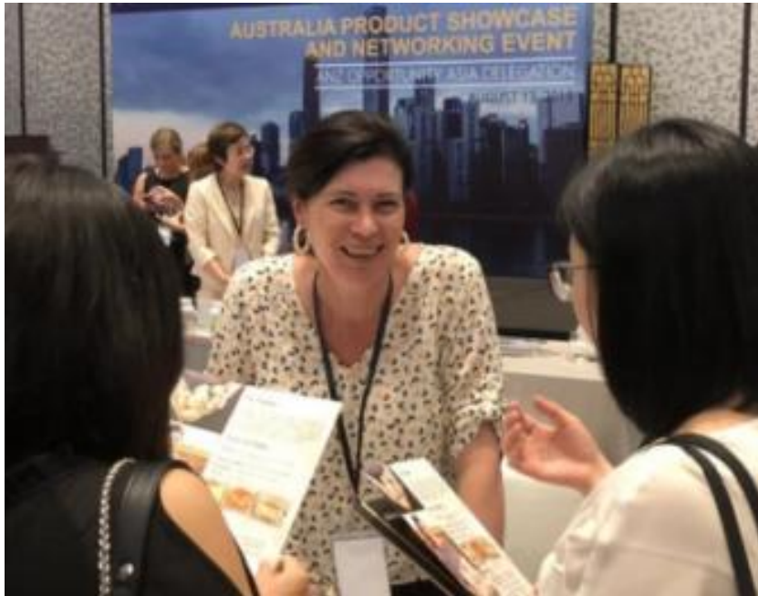
Figure 7: Australia Product Showcase and Networking Event ANZ Asia Delegation South China Guangzhou, 2019

animals or made into powders, flours or used in soups similar to how cabbage is used. The western eating trends are gaining traction in China with love of potato fries, potatoes with cheese and butter and western style dining. There is also a love of Australian products especially fresh food products. While visiting a product showcase and networking event it was evident that Australia is still considered to grow clean and green produce and has trusted farming practices. Potatoes are generally valued when their origin is from Australia although the export market opportunities lend themselves to food service, servicing western style hotel chains and restaurants.