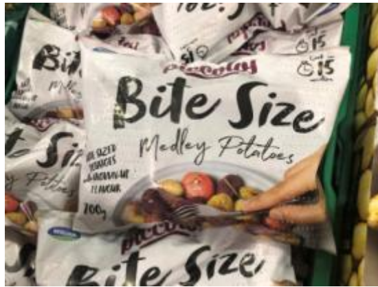
Figure 2: Wilcox Bite Size Medley Potatoes cook in 15 minutes

To maintain an authentic customer focus Wilcox and Sons use time data trends from data companies such as Fresh Logic for market insights, and the Neilson / Morton reports analyse real time current data. Communication to target customers is also very important; branded packaging, social media, printed media, influencers and radio advertising snippets that leads into and after news segments. It is important to have as much access to as many customers as possible. Wilcox also realises that offering low carbohydrate and low GI products cannot be dismissed as a marketing approach.