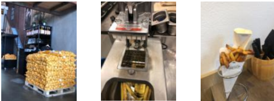
Figure 4: Visit to Pieperz Veghel and Friezzaak Ermelo, Netherlands 2019

In the Netherlands, potato fry speciality stores are a trend, providing a boutique food experience as well as snacking convenience. Friezzaak and Pieperz stores in the Netherlands are a good example of this unique potato convenience concept. Fresh potatoes are hand chipped in front of customers, blanched and fried in special fryers and are served in a wrapped paper cones (Figure 4). Washed potatoes are on display in 20kg bags so customers recognise the potatoes are fresh. Potatoes are ordered, cut, blanched rested and then re-fried in front of the customer. Most stores have several toppings for the fries, mayonnaise, sauces, and mustards. There were a number of fry stores in the Netherlands and most were extremely busy. Some had very good marketing strategies around the supply chain featuring the potato growing farmer. Some stores had queues at least 20 people deep of customers waiting for hot fries. By serving in the cone container customers are able to walk around with on hand fee to dip their fries and snack. In the Netherlands this is considered convenient fast food snacking, an easy snack on the go snack (Pieperz, 2019) (Friezzaak, 2019).