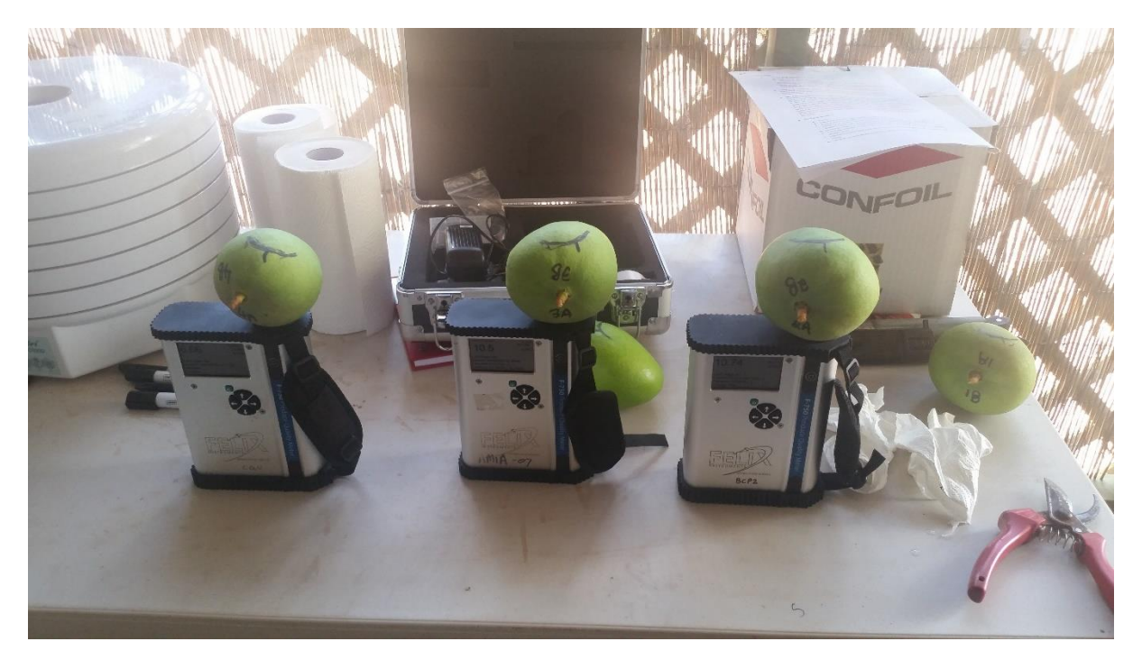
Photo 1. NIR produce quality meters being calibrated s at the same time using a selection of KP fruit with a range of maturities in the Darwin region. Oct 2016