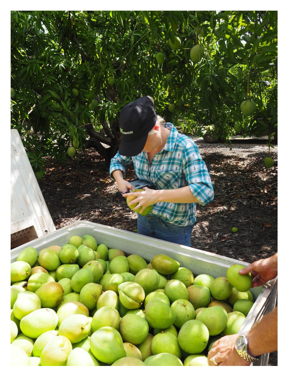
Photo 3. NIR produce quality meters being used by project staff to measure %DM of harvested fruit during November 2016 in the Katherine region.

Photo 2. NIR produce quality meters being used by project staff to measure %DM of fruit still developing on the trees during October 2016 in the Darwin region.