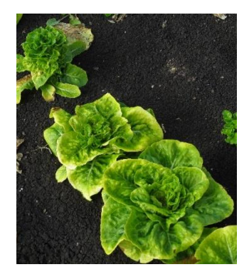
Lettuce showing symptoms of stunting, flattening and yellowing caused by LNYV infection

The weed Sowthistle ( Sonchus oleraceus ) is the major host of both lettuce necrotic yellows virus (LNYV) and the Sowthistle aphid ( Hyperomyzus lactucae ), which is the insect vector responsible for spread of the virus into lettuce crops. Sowthistle infected with LNYV will show no disease symptoms.