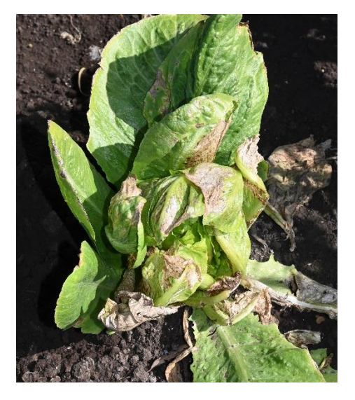
Lettuce showing symptoms of browning of leaf veins (LHS) and leaf death and plant distortion (RHS) caused by LNYV infection

The symptoms of necrotic yellows are similar to those caused by other viruses infecting lettuce, including tomato spotted wilt virus (spread by thrips) and turnip mosaic virus (spread by Green peach aphid). Laboratory tests are needed for accurate identification of the virus or viruses present which will assist in applying management strategies.