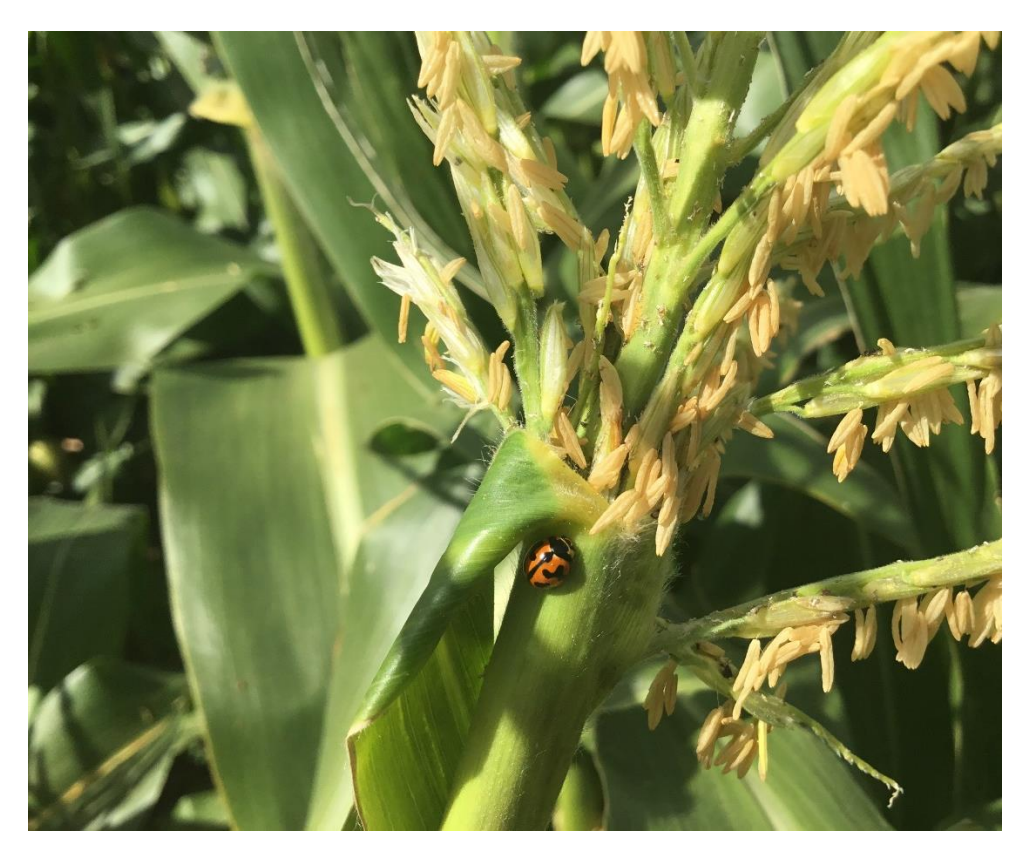
Ladybirds feed on many types of pests. This was one of the most common beneficial insects in surveys of vegetable crops in Australia.