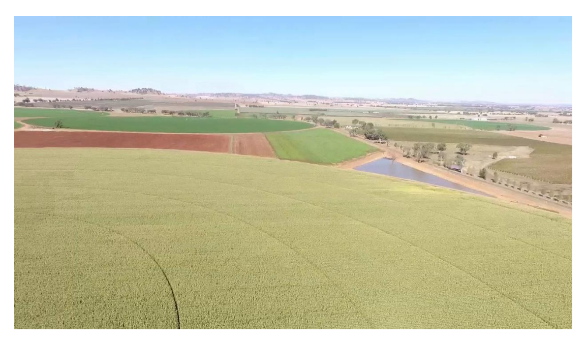
A typical NSW sweetcorn crop is likely to have several different land uses adjacent to its margins and these affect the numbers of pests and beneficial insects in the crop.

<u>http://www.pnas.org/content/early/2018/08/01/1800042115.</u>) It seems that local management may be a more important influence on pest numbers than landscape scale vegetation patterns. This is actually good news for farmers because it implies that the things directly under their control – like pesticide use patterns, the layout of crops in relation to each other, and features like roads and dams – are what really matter.