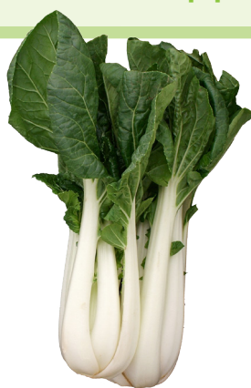
Buk choy Brassica rapa subsp. chinensis