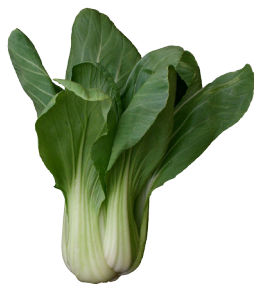
Pak choy Brassica rapa subsp. chinensis