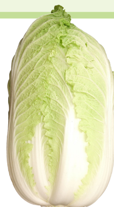
Wombok Brassica rapa subsp. pekinensis