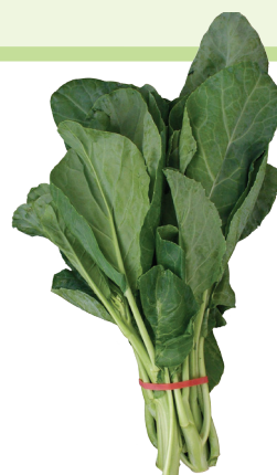
Gai lan Brassica oleraceae var. alboglabra