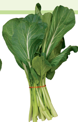
Choy sum Brassica rapa subsp. parachinensis