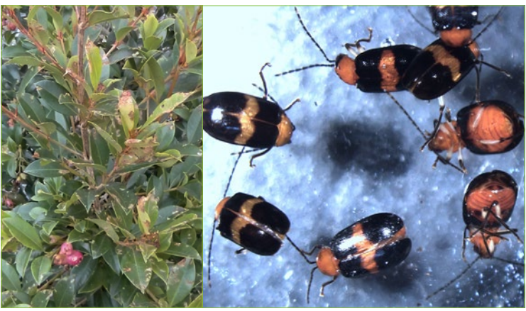
Leaf beetle damage of Syzygium by Monolepta sp. (left), probably M. rubrofasciata (right).

Given the diversity of lifecycles within this group of beetles it is often helpful to identify the species. This may assist in gathering information on when it is likely to be active, the number of generations per year and where each life stage occurs (i.e. where eggs are laid, pupation occurs, etc.). This information can help to break the lifecycle of the pest in a nursery setting.