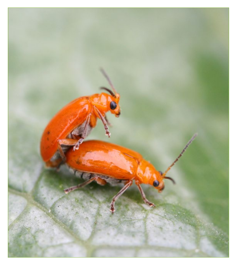
Mating pumpkin beetles on zucchini

Leaf beetles (family Chrysomelidae) are one of the most commonly encountered beetles feeding on plants. Both adults and larvae feed externally on foliage, flowers, pollen and occasionally on or in seed pods. Larvae of some species feed on roots or internally within stems and leaves (leaf mines). There are over 30,000 species described worldwide, and over 2,000 species known in Australia that occur within 10 sub-families. Some of these have more specific common names including tortoise beetles, spiny leaf beetles, shining leaf beetles, cylindrical leaf beetles, leaf monkey beetles, kangaroo beetles and flea beetles. Across these groups there are a number of commonly known pests, e.g. elm leaf beetle, monolepta beetle, pumpkin beetle and orchid beetle.