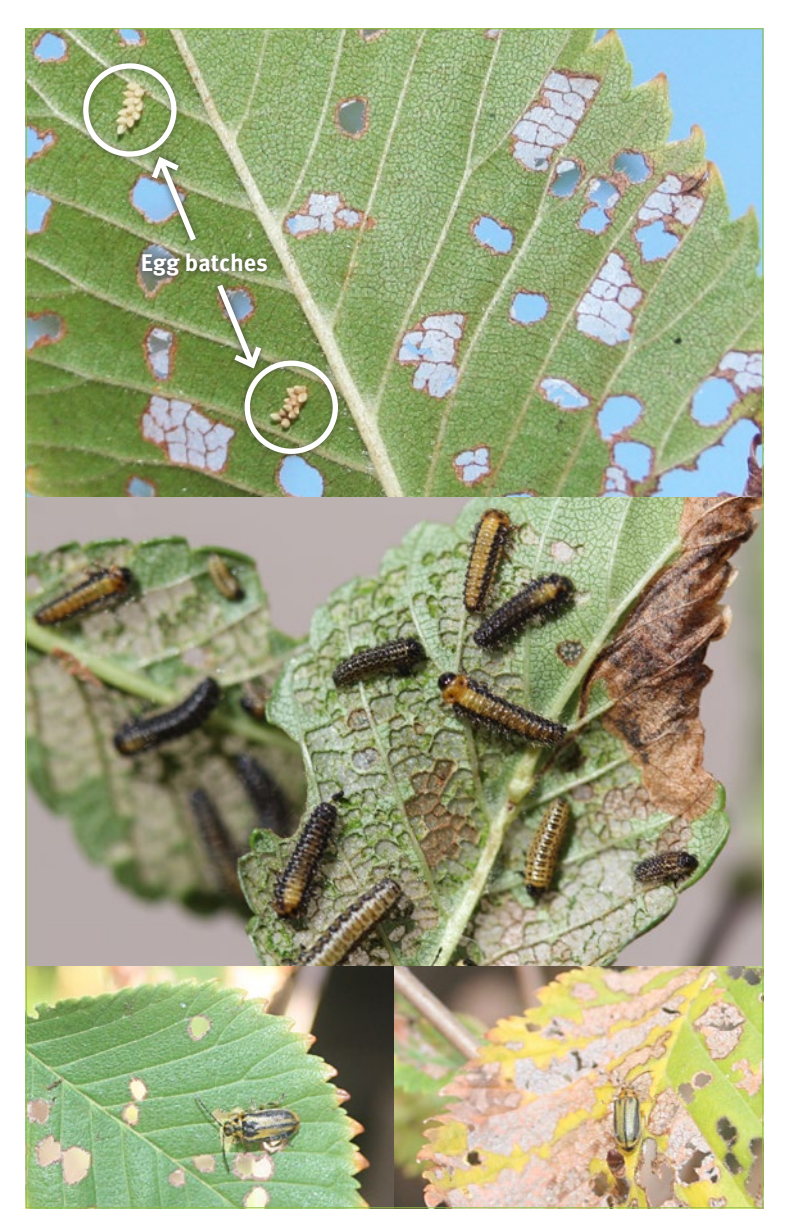
Lifecycle of elm leaf beetle , Xanthogaleruca luteola . Egg batches (top image) and larvae (centre image). Natural variation in adult colouration (below), pupae not shown.

Species with leaf mining larvae may produce long windy mines, typical of many flies and other insects, or blotch mines, where larvae feed in a specific region that gets progressively larger as the individual gets bigger. Leaf mining species are relatively uncommon, making up about