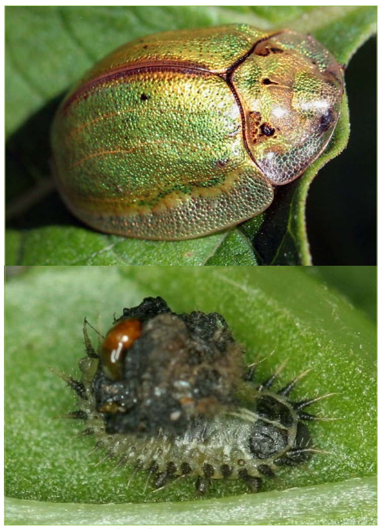
Tortoise beetle adult (above) and larva with excreta carried on its back (below).

Seed feeding chrysomelids tend to feed on seeds or seed pods of Leguminosae, Palmaceae and Convolvulaceae. Tortoise beetles most often feed on Convolvulaceae. Spiny leaf beetles mainly feed on monocots and sometimes Acacia . Shining leaf beetles are most often associated with monocots (particularly grasses and orchids), but some feed on species of Solanaceae and Cycadaceae. Monolepta leaf beetles probably have the most diverse host range, potentially feeding on a wide range of fruit, vegetable and nursery stock plants, particularly Syzygium species.