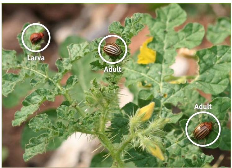
Colorado potato beetle adults (right individuals) and larva (left most individual). This species is not known to occur in Australia.

There are numerous leaf beetles that are exotic to Australia that are serious pests of particular plant species. In particular, Colorado potato beetle feeds on many solanaceous crops causing defoliation and leaving a sticky black excrement over the plant. Many other species do not occur in Australia. If you observe a beetle that you suspect is an exotic species, call the Exotic Plant Pest Hotline on 1800 084 881 and or submit a sample to a diagnostic laboratory for identification.