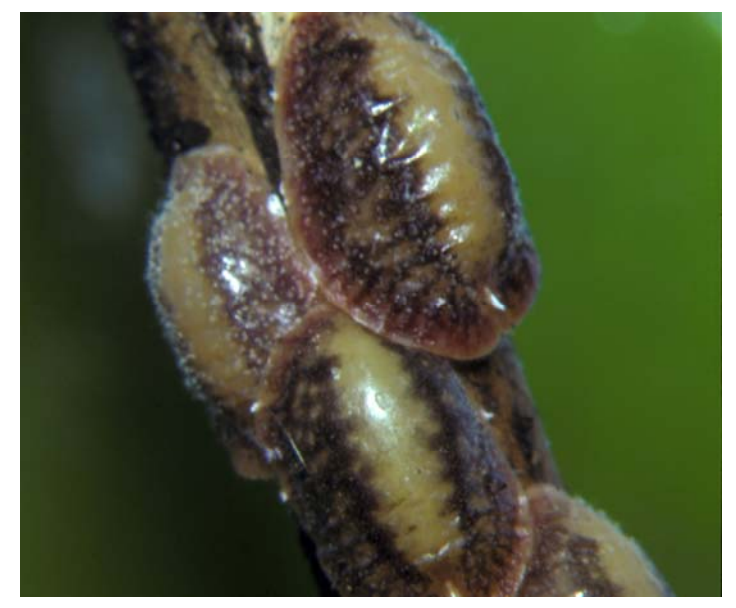
Fig. 2. Pink wax scale on Schoenoplectus , lake club rush (top). Soft wax scale, Ceoplastes sp. (middle - John. A. Weidhass, Virginia Polytechnic Institute and State University, Bugwood.org); cottony camellia scale (bottom - United States National Collection of Scale Insects Photographs, Bugwood.org.