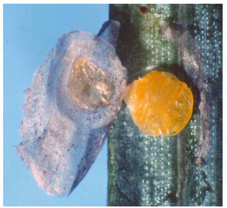
Fig. 3. Hard scale with cover removed showing body beneath.

Remove plants with heavy infestations, taking care to reduce spread of scale insects while doing so. If infestations are limited to a particular branch and it can be pruned, remove this plant material and monitor closely to ensure the rest of the plant is clean. Also remove crop debris regularly and disinfest the growing area to reduce reinfestation of pests into the crop.