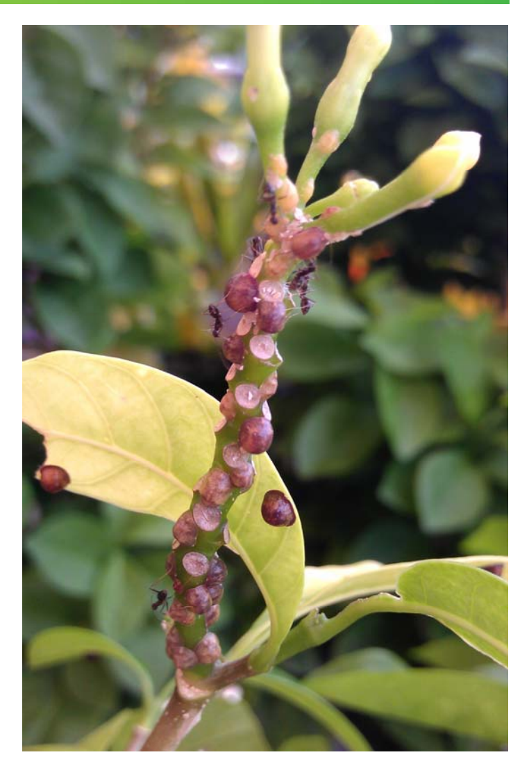
Fig. 1. Coccid (soft) scale insects attended by ants.

All scale insects have a similar basic biology, though exceptions occur. Scale insects are sack-like and often do not have functional legs. The 'scale' refers to a substance secreted over the back of the insect. In most cases, adult females are sedentary and do not move. Most species lay eggs underneath their body, though some lay live young. Some species are parthenogenetic, meaning that they can