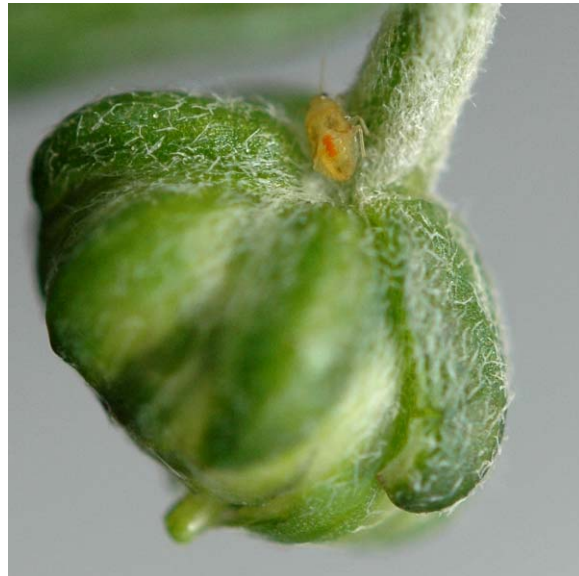
Fig. 8. Orius armatus nymph on the bud of a chrysanthemum.

Orius armatus (Fig. 8) is an Australian native pirate bug which is similar to other Orius spp. overseas, however little research into its biology has been completed. Orius is the only commercially available thrips predator that consumes significant numbers of adult thrips. Besides adult thrips, Orius will consume thrips larvae, aphids, spider mites, butterfly and moth eggs and pollen. Orius develops from egg to adult in about 12-18 days at 30-25°C. Adults live for 3-4 weeks. At 20°C, Orius consumes about 2 thrips per day, but will kill more thrips at high pest densities and temperatures. Adults are able to fly and readily disperse to new areas to find prey. Orius is light sensitive and less likely to be active during cool, dark periods of the day.