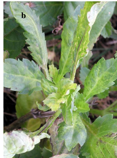
Fig. 5. Symptoms of TSWV on cobbler's peg (a) and snake weed (b) which can be common weed hosts.