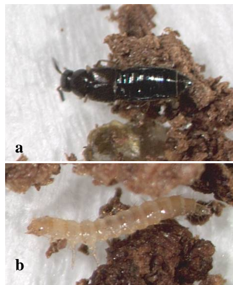
Fig. 11. Dalotia coriaria adult (a) and larva (b). They are about 3-4 mm in length.

There are two producers of insect-eating nematodes in Australia, Ecogrow and Becker Underwood.