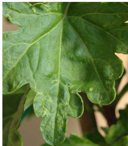
Fig. 2. Thrips damage on chrysanthemum leaves.