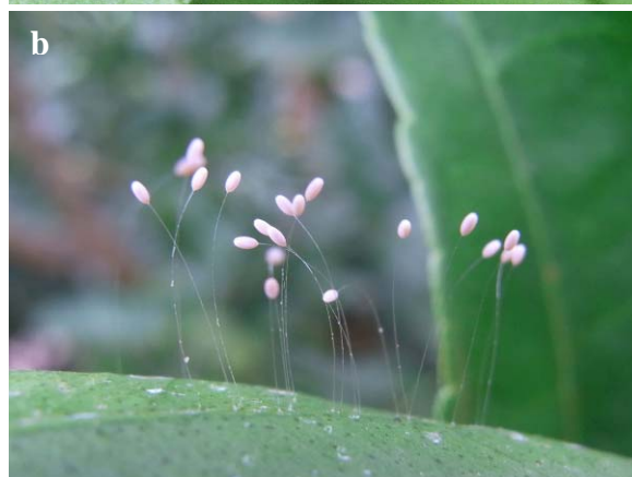
Fig. 10. Larvae of the green lacewing (a) grow to about 8 mm. Eggs are laid in clusters (b), each on a thin stalk.