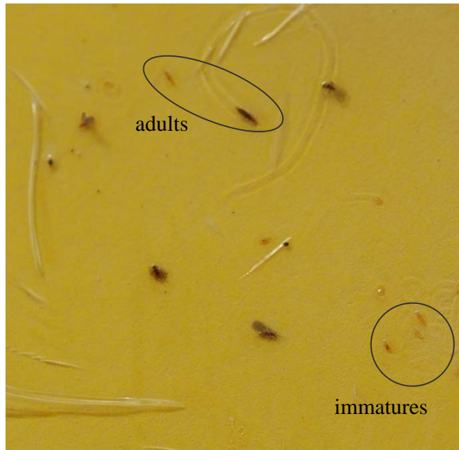
Fig. 7. Yellow sticky trap placed under the foliage of plants to trap WFT adults and immatures.

Keeping long-term records can help to identify areas and varieties that are more susceptible to infestations. It is also important to continue monitoring following application of insecticides or release of biological controls to determine the effectiveness of treatments. These records can assist with making management decisions in the future. Insect monitoring data sheets are available in the BioSecure HACCP protocols available on the NGIA website ( www.ngia.com.au ). Alternatively, simple spreadsheets can be created and modified to suit your farm.