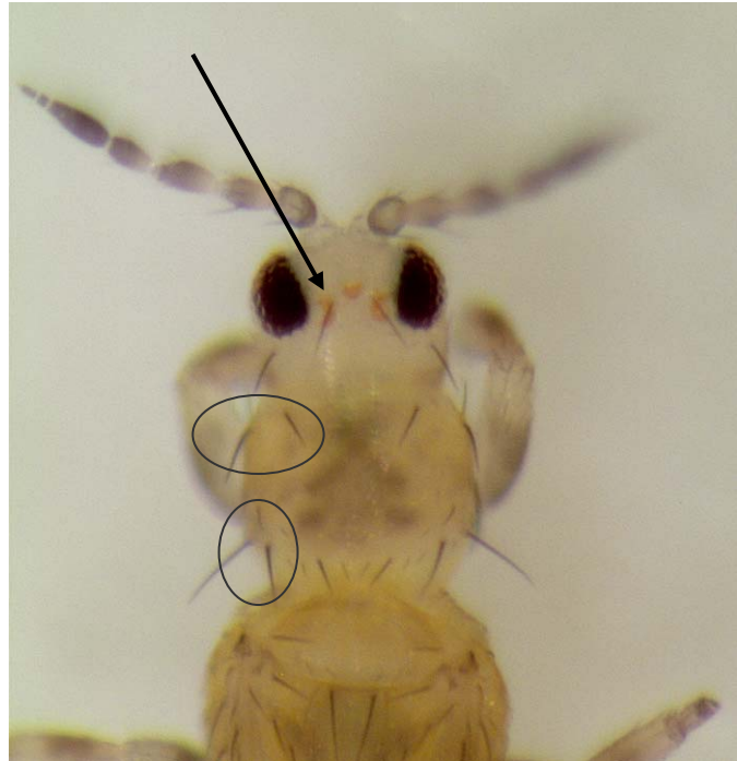
Fig. 6. Adult WFT showing important taxonomic characters including two pairs of large setae on the front and back of the pronotum (circled) and large pair of setae between red ocelli relatively wide. This provides only a preliminary identification for WFT.