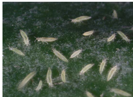
Fig. 1. First and second instar WFT larvae on a cucumber, about 0.5-1 mm in length.

Female WFT lay eggs into flowers and foliage and hatch in about 2-4 days at optimal temperatures of 25-30°C 1 . There are two larval instars which take about 8-10 days, depending upon the temperature and host plant. Late 2 nd instar larvae either pupate on plants, generally in small crevices, or in the soil. The proportion of thrips that pupate in the soil or on plants is directly influenced by humidity; 80% RH or less causes