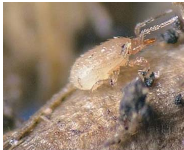
Fig. 11. Both Stratiolaelaps scimitus and Geolaelaps aculeifer are very similar in appearance. Above is an adult S. scimitus .

Geolaelaps aculeifer is a relatively large, brown to orange coloured, soil-dwelling predatory mite (about 1 mm in length). Nymphs and adults feed on thrips pupae that pupate in the soil and on a variety of other soil organisms, including nematodes, springtails, fungus gnat larvae, root aphids and mites, preferring moist habitats high in organic material. The killer mite takes about 12 days to complete development at 27°C, but up to 40 days at 16°C and can survive for long periods scavenging on soil arthropods without specific pest prey.