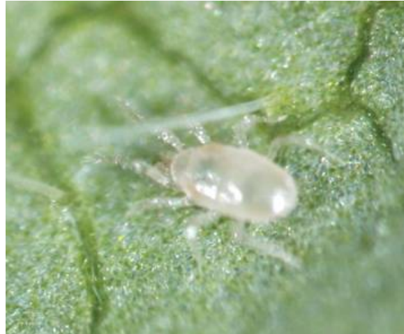
Fig. 9. The predatory mite, Transeus montdorensis , is an opaque white or yellow mite a little less than 1 mm.

The green lacewing has a relatively wide host range, feeding on aphids, spider