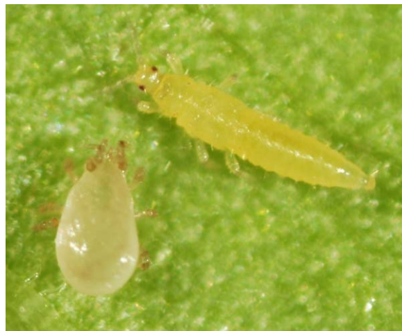
Fig. 9. Neoseiulus cucumeris next to a larval thrips.

Cucumeris is a small (a little less than 1 mm), tear-drop shaped, opaque predatory mite which looks similar to montdorensis (below) and is of the same family as the widely used spider mite predator, Phytoseiulus persimilis . Cucumeris feeds on a variety of prey including thrips larvae, broad mites, pollen and a variety of other small insect and mite prey, including spider mites 15 . Development of cucumeris takes about 8-11 days at 25-20°C and subsequent adults live for about 3 weeks. No development occurs less than 13°C and above 32°C. They prefer conditions greater than about 65% RH. Females lay about 30 eggs over their adult life 16 and may eat up to 4 thrips larvae per day 15 . Cucumeris can be used in most greenhouse and nursery crops and will persist without prey