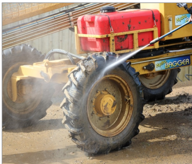
The removal of dirt is an essential step prior to disinfection using a QA product.

If there are any concerns about the impact of QA compounds, a rinse step should also be considered after the appropriate contact time as stated on the product label.