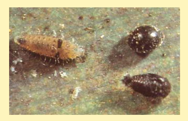
Figure 2. The larva (left), pupa (bottom right) and adult ladybird beetle (top right), of Stethorus

Predatory insects can be encouraged by limiting the use of chemicals that are harmful to them. This includes broad spectrum insecticides and miticides in the case of the predatory mites. Stethorus (figure 2) and the large metallic blue lady beetles, Halmus ovalis are naturally occurring. Their populations will lag behind the spider mites as they will need the spider mites present as a food source to sustain them. Predatory mites such as Neoseilus californicus and Phytoseilus persimilis can also be purchased for release in your paddocks. Due to the climatic conditions in far north Queensland and the nature of the mites, N. californicus is possibly the more appropriate beneficial mite to source.