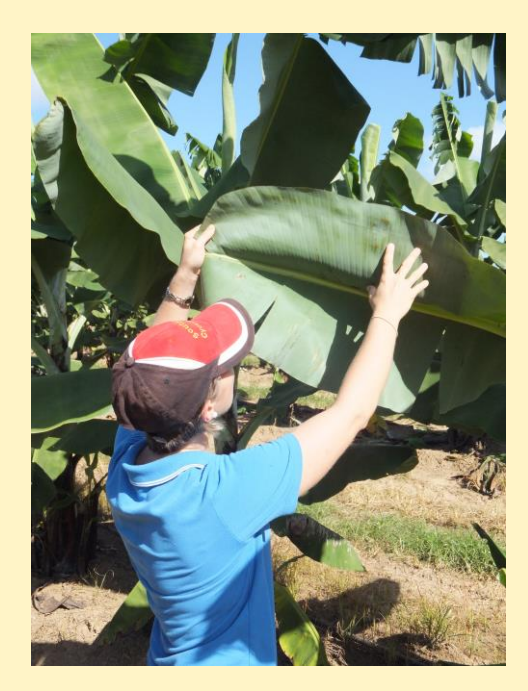
Figure 3. To monitor for the presence of mites and their predators, inspect the underside of the leaf

Mites have a short life cycle which can be as short as 7-10 days during hot-dry conditions and as long as 4 weeks. Over the summer months, weekly monitoring would be preferable however fortnightly is sufficient during cooler, wet conditions. To monitor for the presence of mites inspect the underside of the leaf. It is important to take note of the youngest leaf the mites are present on, the relative numbers of the various mite life stages and the presence of predators. In general, the greater the number of mites and the younger the leaf they attack, will result in more severe damage. However, treatment may not always be required if predators are present.