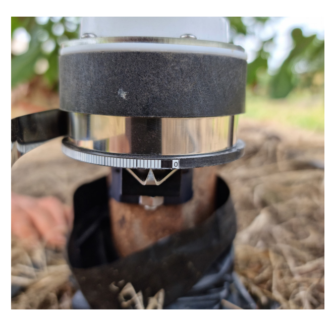
Band dendrometer installed on avocado tree