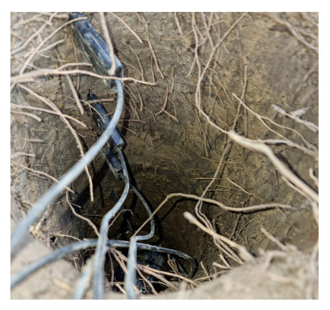
Soil moisture sensors installed in the rootzone

Band dendrometers have been installed near the base of six trees in the avocado orchard at AustChilli. The dendrometers will provider real time data on the circumference of the trunk, which is used to calculate maximum daily shrinkage and the growth rate of the trunk. Tree stress can be detected early if either the trunk circumference or growth rate is measured outside the expected values. The dendrometers have a resolution of 1\mu m, allowing for analysis of any variations in trunk circumference. Band dendrometer data pairs well with soil moisture data, also measured at the same location.