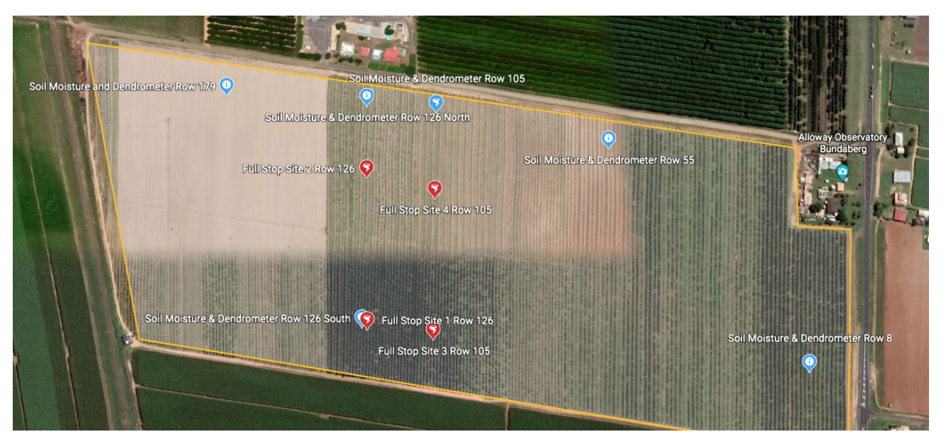
AustChilli avocado sensor layout