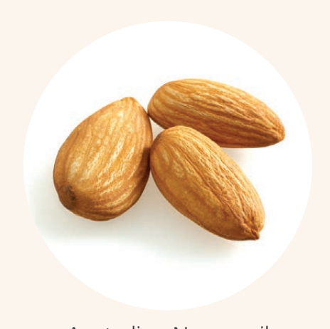
Australian Nonpareil Australian Nonpareil almonds have the 'classic' flavour and shape loved all over the world.