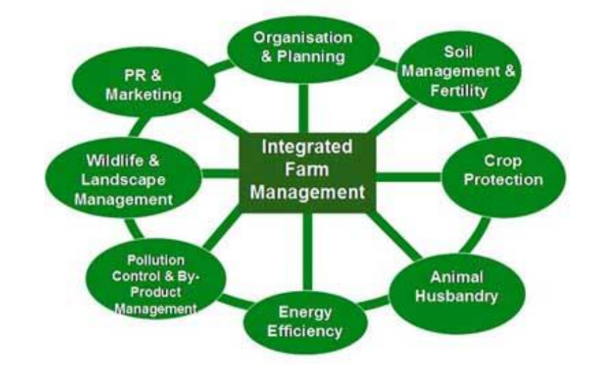
Figure 1: Operations of Farm Management Software

The following figure depicts the interaction of farming management activities: