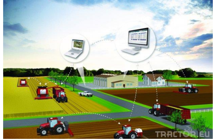
Figure 2: Graphic depicting Telematics