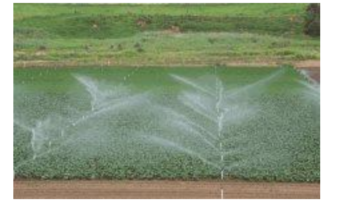
Figure 3: Innovative approaches to precision irrigation