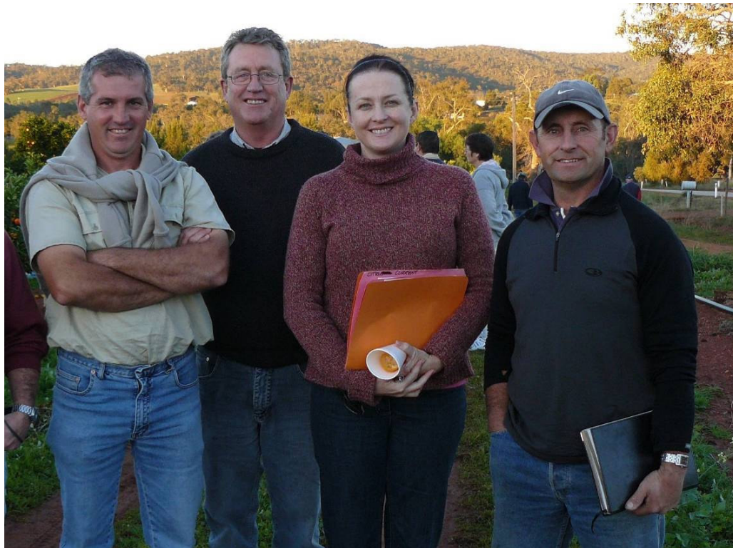
Left: WA citrus growers inspect a property at Moora in WA during a recent CITTgroups Australia tour.

CITTgroups Australia activities are aimed to provide a safe learning environment that growers can easily access, gain information, and provides an opportunity for input into the industry.