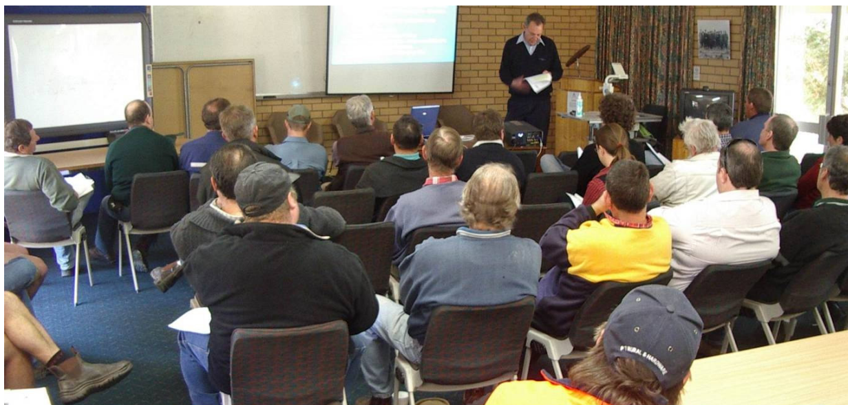
Above: In a well attended CITTgroup activity in August 2007, a representative from the local water authority speaks to concerned citrus growers about water allocation and storage levels in the Murray Valley area.

Due to administration reasons, the project is now identified as "CT07056 CITTgroups Australia 2008 – 2009 (continuation of CT05009)", which will commence as of 1 July. The review however will encompass the project CT05009.