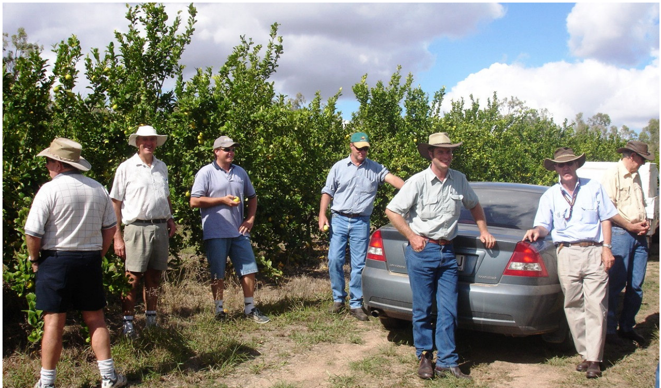
Above: Growers inspect a citrus orchard during a CITTgroup activity in Queensland in May 2007

Currently the CITTgroups Australia project is conducted in the Riverland, Murray Valley, Riverina, NSW Central Coast, Queensland, and Western Australia.