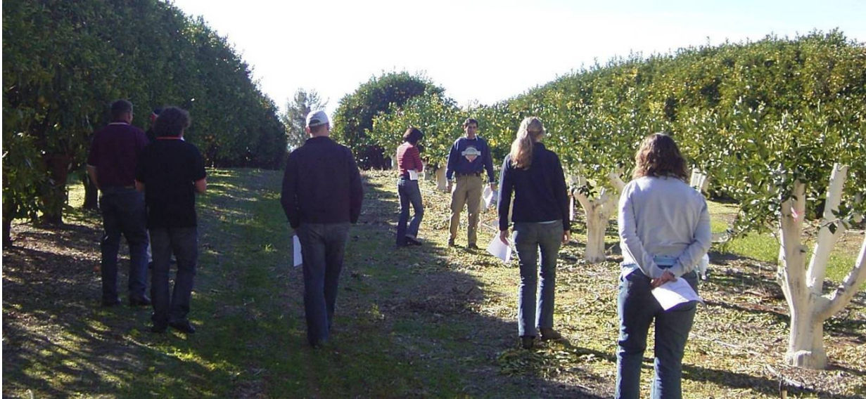
The national CITTgroup Coordinators visit the NSW DPI research station (top) and the AusCitrus site in Dareton (below), NSW during their annual face to face meeting in May 2008.