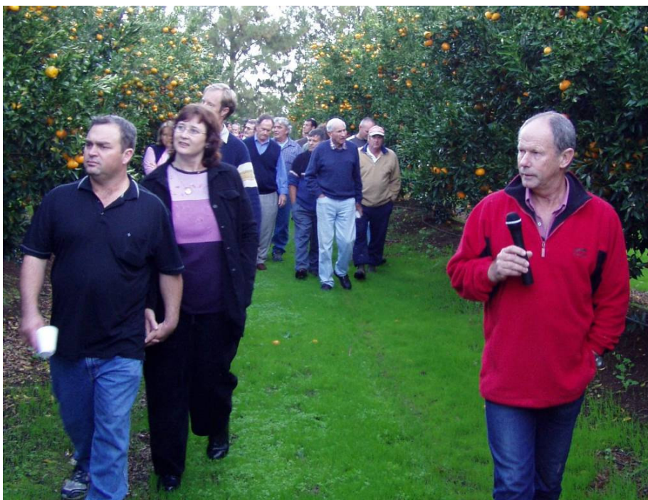
Left: Orchard Tour in Harvey, Western Australia for a CITTgroup activity on weed control and mulch in May 2008

The future of the CITTgroups Australia program lies in its ability to appeal to and meet the needs of growers. Its strength lies in its current flexibility in that it can operate differently in each region, allowing it to respond to growers' needs under differing growing conditions, marketing requirements, local industry structures and grower profiles.