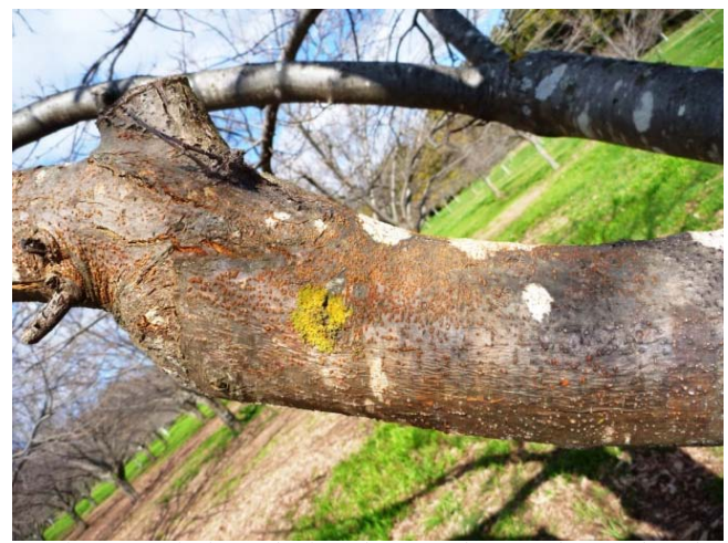
"Chestnut Blight, a declared exotic disease detected in the Ovens Valley, North East Victoria, early September 2010"

out and the website where developments and instructions were communicated. Also liaising with VicDPI weekly (sometimes daily) and was appointed to handle administration for the CAI Chestnut Blight Incursion Taskforce, eight additional industry meetings were held in connection with the outbreak of chestnut blight, all minuted and circulated. These activities represented 80% of Communication activities for 3 months from 1<sup>st</sup> week in September, 2010.